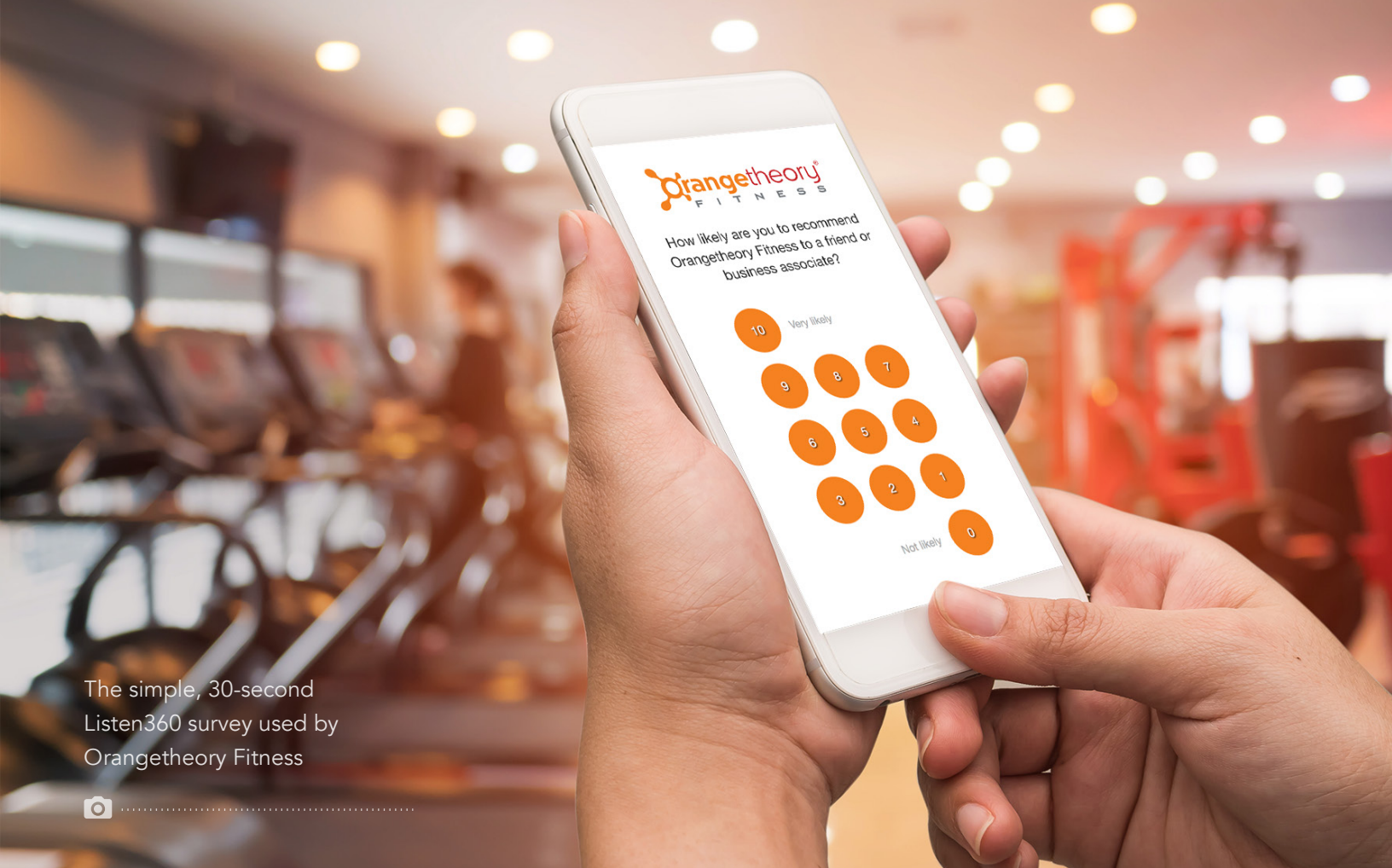
The simple, 30-second Listen360 survey used by Orangetheory Fitness